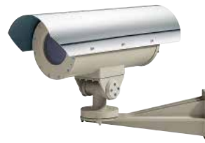
EXHC + EXHS000 + EXWBJ