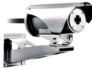
MAXIMUS MVXT + NXWBS1