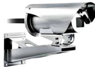
MAXIMUS MVX + NXWBS1